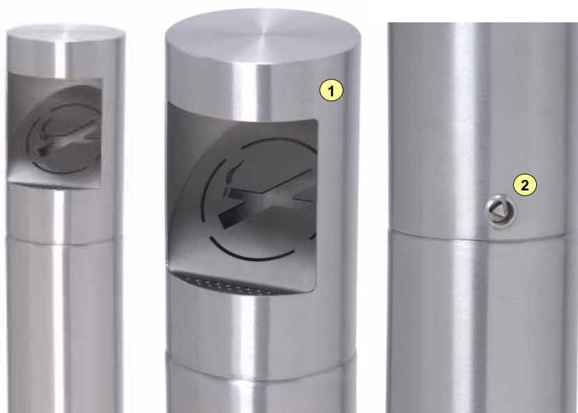
1- Removable head 2- Lock ▲ 11 (rear side of ash urn).